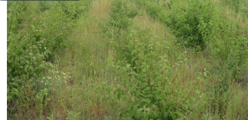
An American plum shrub thicket planting after 6 years. Most shrubs are now producing fruit!