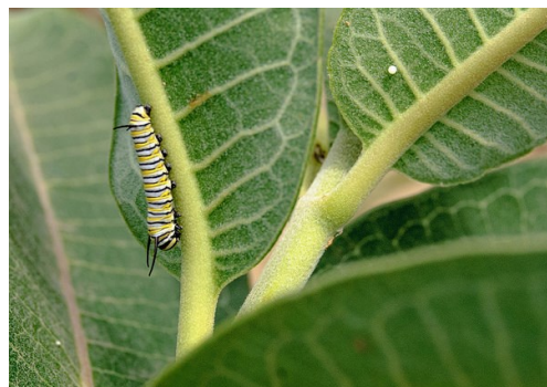
Common milkweed is essential to the monarch butterfly life cycle. Common milkweed is included in CFW seed mixes to increase habitat for monarchs.