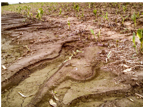
When corners are established to permanent wildlife habitat, the erosion that occurs on row crop lands from water will be significantly reduced.