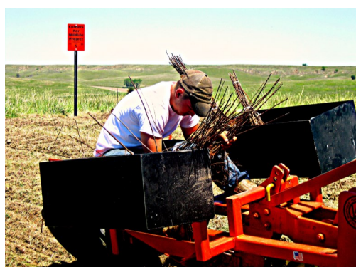
The Corners for Wildlife program is designed to help establish wildlife habitat on center pivot corners not capable of sustaining high yields when planted to row crops.

The CFW program is a popular option among landowners. Landowners receive a rental payment for a five-year contract to establish and maintain high diversity wildlife habitat on areas associated with a center pivot.