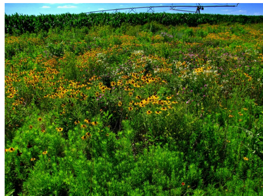
High diversity grass and wildflower mixes are used in the CFW program to provide excellent nesting and brood rearing cover as well as pollinator benefits.